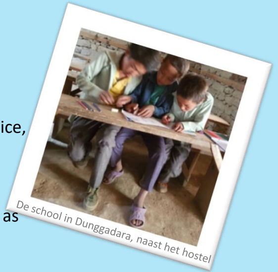
De school in Dunggadara, naast het hostel