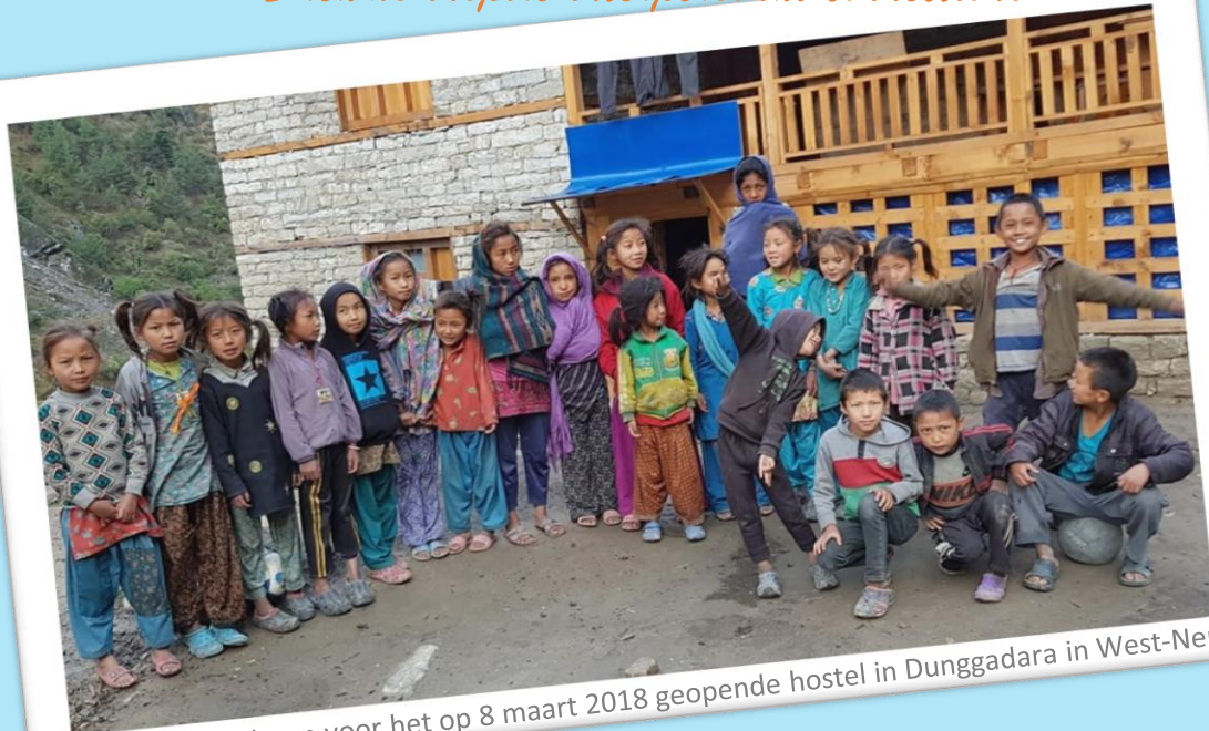
De groep kinderen voor het op 8 maart 2018 geopende hostel in Dunggadara in West-Nepal

Dreams inspire interpersonal connections